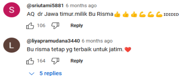
Figure 5. Evidence of public rejection in the comments section.

leadership, which is recognized and appreciated by local residents. In addition, the social and cultural conditions in East Java, which tend to prioritize harmony and cooperation, may also be a strong reason why this support has grown. Thus, this support not only reflects success in politics, but also shows that the people of East Java feel connected and well represented by this figure, both politically, socially, and economically.