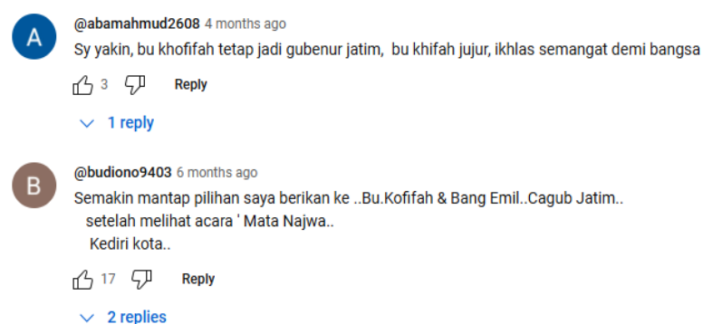
Figure 4. Evidence of support for Khofifah in the comments section.

This can be seen from how Khofifah carried herself in the program. Khofifah rarely used complicated political sentences so that the public could understand what she was talking about. With this semi-formal setting, Khofifah was able to position herself to respond to various questions asked by Najwa Shihab, the host of the program.